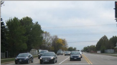
Traffic & Parking Impact Studies