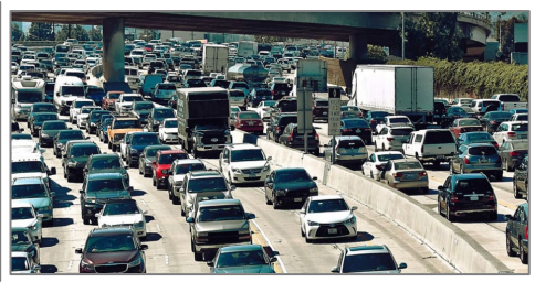
Traffic Data Collection